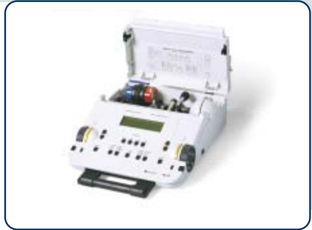
MA 53 with accessories in integral carrying case

The MA 53 offers high tone audiometry with AC for advanced diagnostics.